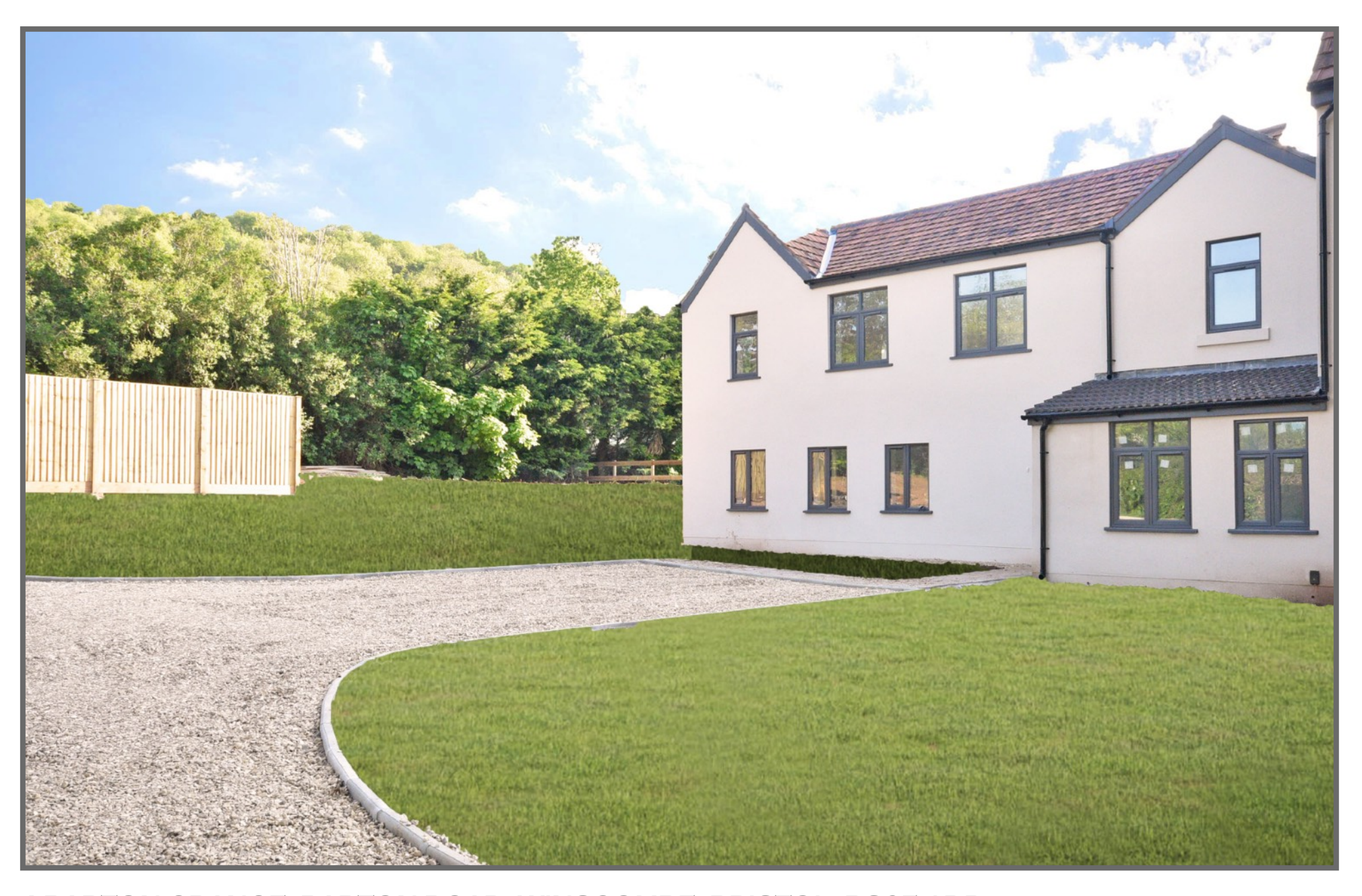
4 BARTON GRANGE, BARTON ROAD, WINSCOMBE, BRISTOL, BS25 1DP